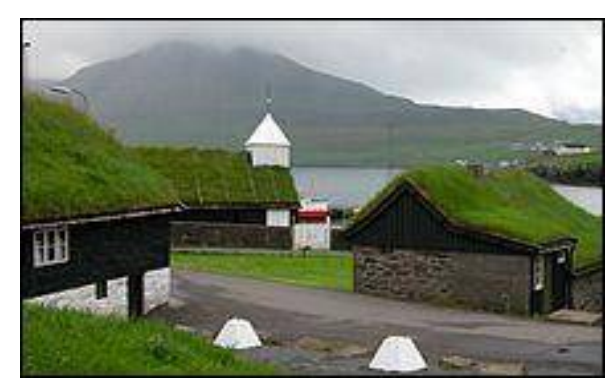
Fig.1 Green Roof Building